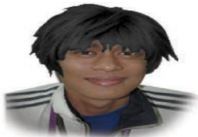
Rambut Yang Tidak Kemas Unruly Hair