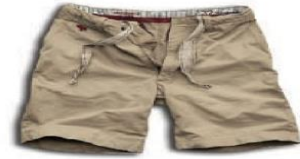
Berseluar Pendek Shorts