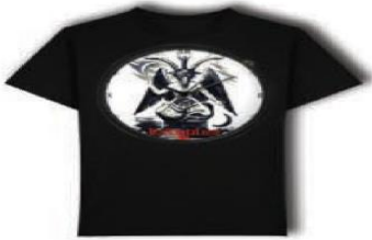
Baju T Bergambar Yang Bertentangan Tatasusila T-Shirt with Derogatory Picture/ Words