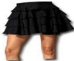
Skirt Pendek menampakkan Lutut Skirt that shows the Knee