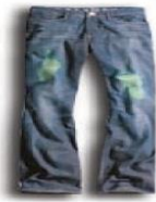
Berseluar Jeans Bercompang-camping Tattered/Ripped Jeans