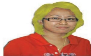
Berambut Warna Fesyen Ganjil Brightly Coloured and Odd Hairstyles

Refer to https://hep.um.edu.my/URUSAN%20TATATERTIB/dress-code.jpg