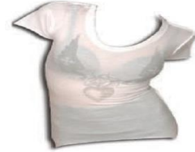
Baju Jarang dan Ketat Tight and See-Through Clothes