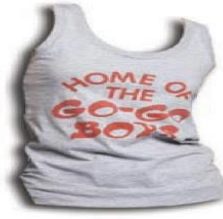
Tanpa Lengan Sleeveless