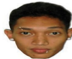
Aksesori Muka Face Accessories