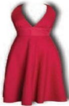
Mendedahkan Bahagian Badan Body-Revealing Clothes